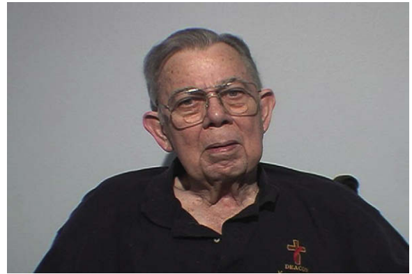
Fig. 2. Patient's anterocollis markedly improved within 4 weeks after treatment with BoNT (Botox® 75 U in the right and 50 U in the left scalene).

(Jankovic, 2008; Ashour and Jankovic, 2006). BoNT has been used in the treatment of axial postural abnormalities, including scoliosis, with variable success. In one study, six of nine patients with lateral axial dystonia (scoliosis) reported benefit as indicated by improvement in the Trunk Dystonia Disability Scale and visual analog scale after EMG-guided injection of 500 U of Dysport® into paraspinal muscles at the level of L2–L5 on the side of the trunk flexion (Bonanni et al., 2007).