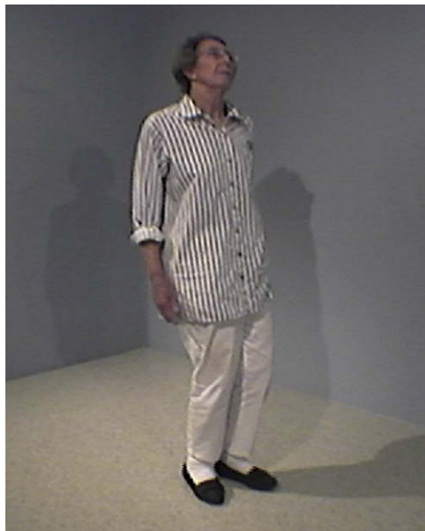
Fig. 4. Patient's camptocormia markedly improved after treatment with BoNT (Botox® 200 U in each rectus abdominus).

is held in a postural position, the so called re-emergent tremor, that often interferes with the ability to hold objects such as newspaper or a cup, and is more troublesome for patients with PD than the typical rest tremor (Jankovic et al., 1999). While levodopa and other anti-PD treatments are usually effective in improving this cardinal feature of PD, other treatment such as BoNT and deep brain stimulation must be considered in patients who fail to obtain satisfactory relief (Diamond and Jankovic, 2006).