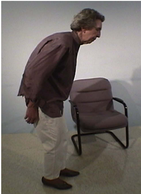
Fig. 3. Patient with PD and camptocormia.

is held in a postural position, the so called re-emergent tremor, that often interferes with the ability to hold objects such as newspaper or a cup, and is more troublesome for patients with PD than the typical rest tremor (Jankovic et al., 1999). While levodopa and other anti-PD treatments are usually effective in improving this cardinal feature of PD, other treatment such as BoNT and deep brain stimulation must be considered in patients who fail to obtain satisfactory relief (Diamond and Jankovic, 2006).