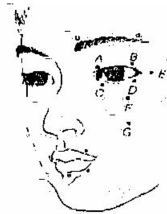
Fig. 2 Injecting site of hemifacial spasm